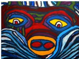
Gregory Lannan The Wild Wind , Toronto