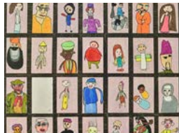
The Alizé Workshop Look at yourself in the mirror , Montréal