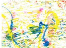
Céline Pinel Untitled, L'Étoile