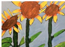
Melina Boote Sunflowers , Vancouver