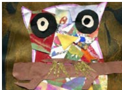
Shelley Blake-Knox Midnight Owl , Comox Valley