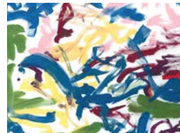
Chantal Pinault Spring Energy , North Bay