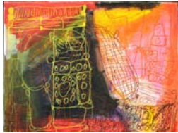
Sachan Sarwal Back to the Future , Antigonish