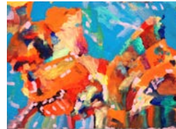
Céline Pépin Untitled , Mauricie