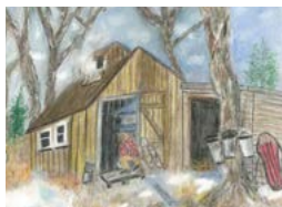
Emily Arbeau Sugar Shack , Fredericton